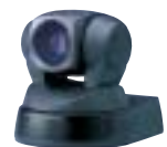
EVI-D100/D100P Communication Color Video Camera Dimensions: 113 (W) x 120 (H) x 132 (D) mm Mass: 0.86 kg